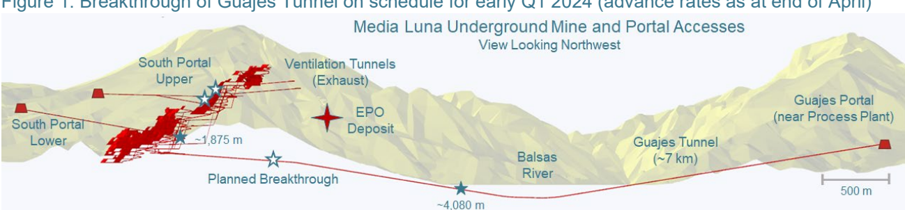
Figure 1: Breakthrough of Guajes Tunnel on schedule for early Q1 2024 (advance rates as at end of April)

As at the end of April, the Guajes Tunnel had advanced 4,080 metres, with daily advance rates averaging 7.0 metres over the last three months, including a record average daily rate of 7.4 metres in February. At South Portal Lower, development rates have increased throughout 2023 with a 3-month average daily advance rate of 4.3 metres through April (including 5.1 metres per day in April), compared with an average rate of 3.8 metres over the last twelve months. The increased rates reflect improved ground conditions now that tunnelling has moved into the competent granodiorite lithology from the less competent shale and limestone lithologies encountered last year. With the lower access tunnel completed on the south side, development of the main lower spiral ramp is underway and is on track for completion by the end of June.