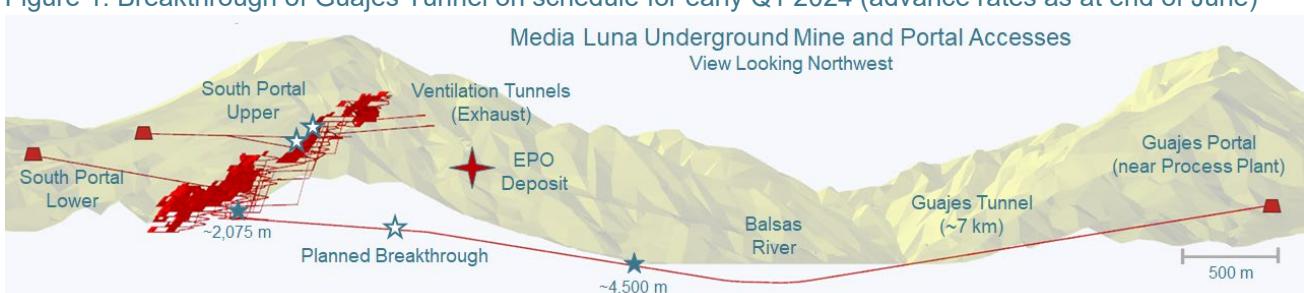
Figure 1: Breakthrough of Guajes Tunnel on schedule for early Q1 2024 (advance rates as at end of June)

As of the end of June, the Guajes Tunnel had advanced 4,500 metres and South Portal Lower had advanced 2,075 metres. Development of the main Media Luna Lower spiral ramp continued and was completed in mid-July. This crew then moved to advancing infrastructure excavation in the lower part of the mine in preparation for the arrival of the underground construction crews, all of which was enabled by the excellent progress of the Guajes development crews. With this work complete post-quarter end, the development crew will now commence advancing the Guajes Tunnel from south to north.